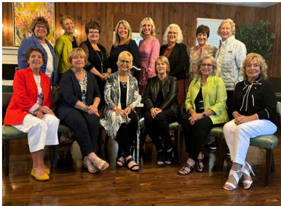
Attendees of the June 6th Glitz & Glam. There will be another Glitz & Glam on Thursday July 11th. Hope to see you there!