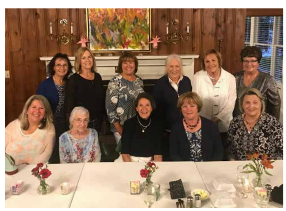
Our third and final Glitz & Glam of 2022 was held on August 16. Thanks to the committee for their help in organizing this fun get together.

Reservations are a Must Make reservations by Sept. 13th