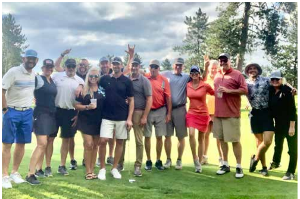
Here's a group that threw together a scramble last weekend. Just another example of the FUN we have at ECC!