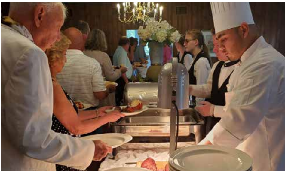
The "Steak and Lobster" event in July was a wonderful event. There were 102 guests who enjoyed the food and danced to music by "The Divas".